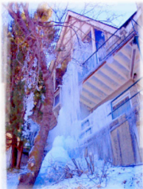
Burst pipe and total house loss