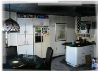
Soot damage to kitchen