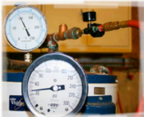
Defective water heater relief valve

It's here again... the season of cracked boilers, frozen pipes, burst oil tanks, chimney fires, soot damage, hot water heater floods, and an almost endless list of homeowner horrors. The good news is that ISE is geared up and ready, with our network of licensed engineers, heating system contractors, and plumbers standing by all over New England... from Northern Maine to The Cape and The Islands. ISE can quickly respond to requests for service allowing us to document, film, and photograph a loss site before evidence is damaged, lost, or altered. This is of vital importance for investigations caused by fires, freeze ups, floods, and other catastrophes.