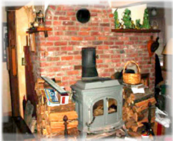
Wood burning stove chimney fire