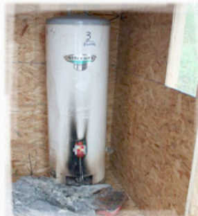
Fire re-creation involving malfunctioning water heater