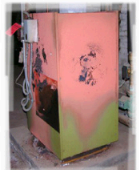
Overheated boiler and resulting fire