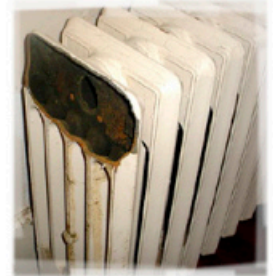
Frozen radiator flood