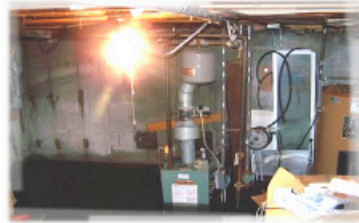
Flooded basement from cracked boiler